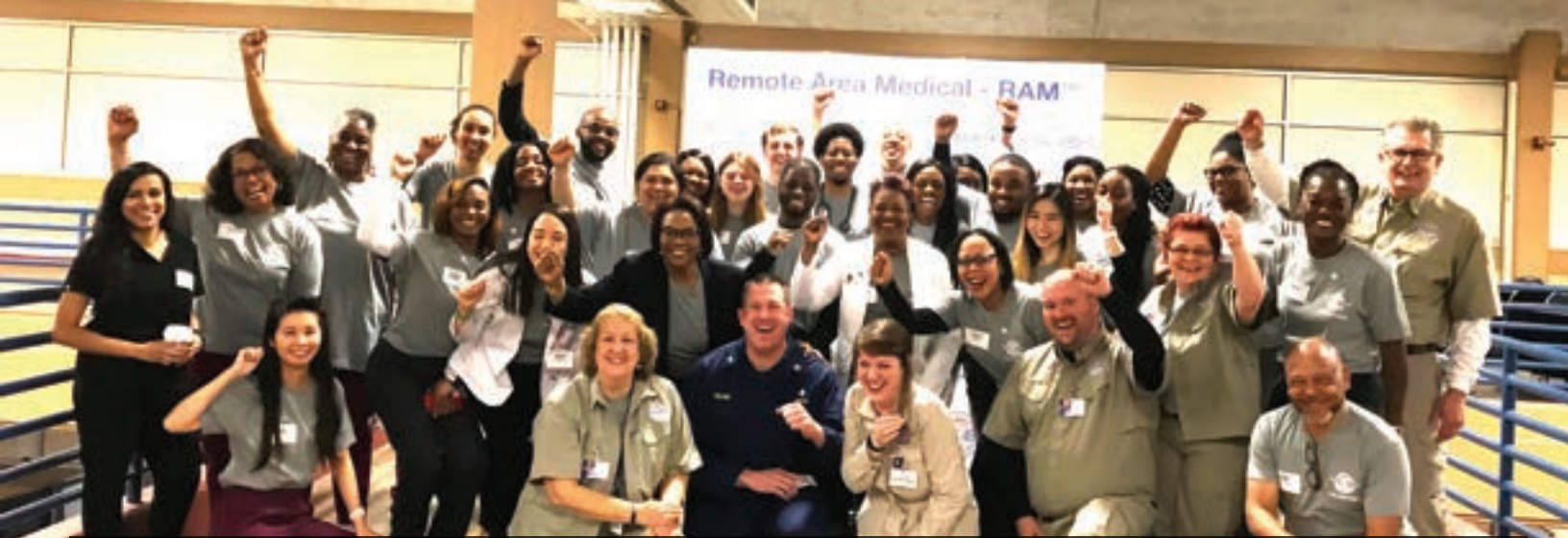
RAM Team members, IP Student Leaders, Faculty Advisors, and NDA Officers at the Jacob Center, Knoxville Clinic.

Participants included eighteen (18) students from eight (8) universities and nine (9) faculty advisors: Howard University College of Dentistry and School of Communications; Columbia University School of Dentistry; Harvard University School of Dental Medicine and Joseph L. Henry Fellowship Program; Meharry Medical College Schools of Medicine and Dentistry; University of Tennessee-Knoxville Center of Public Policy and Administration; Morehouse School of Medicine and School of Public Health; A.T. Still University School and the Harriet Rothkopf Heilbrunn School of Nursing Long Island University-Brooklyn.