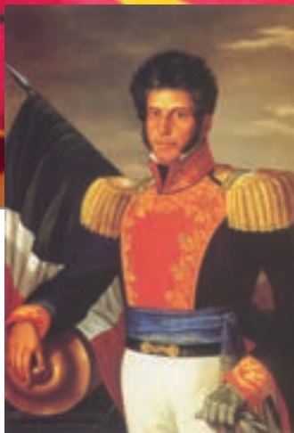
Vicente Guerrero General