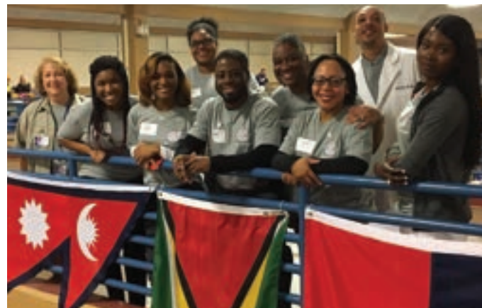
IP Student Leaders program participants with RAM team