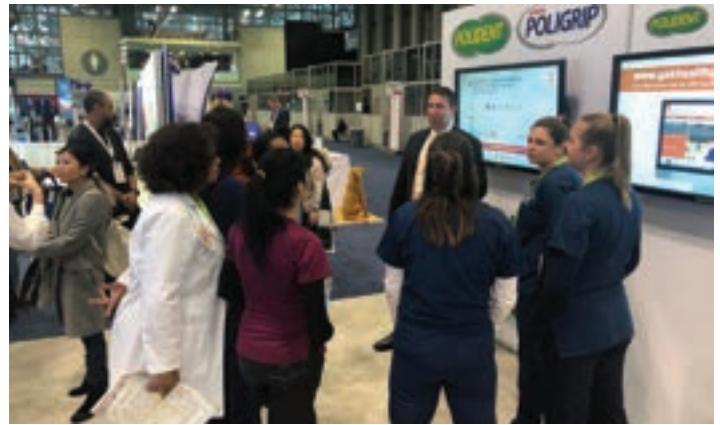
Nurses in GNYDM Exhibit Hall