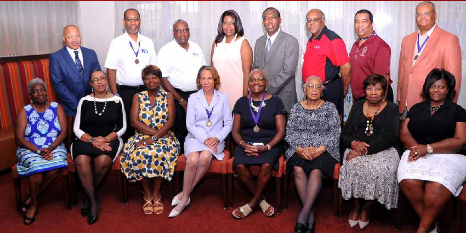
NDA and NDAA Past Presidents held their annual breakfast to identify and discuss strategies for continuing support of the professional via their respective organizations.