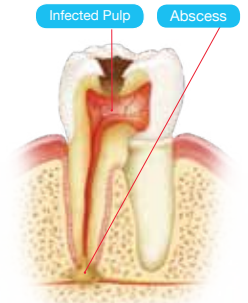
Infected pulp, or nerve, can cause an abscess, which can require root canal treatment