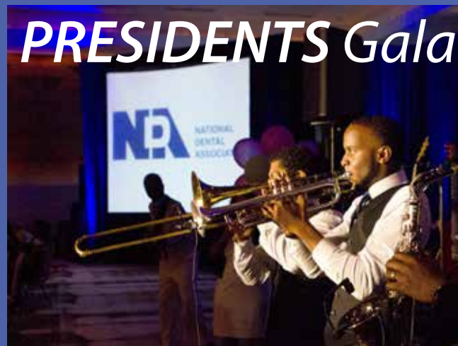
The Infinity Show Band of Atlanta provided hours of amazing music for dancing and celebrating.