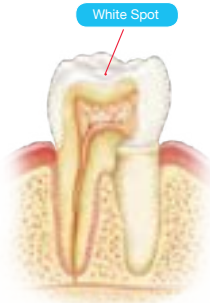
White spots are the earliest stage of decay and is reversible

Both children and adults are at risk of developing cavities, or tooth decay. Cavities are the result of poor oral hygiene and retained dental plaque on the tooth surface. Bacteria in plaque produce acid that destroys the tooth's enamel and its underlying layer the dentin, and can eventually reach the tooth's nerve.