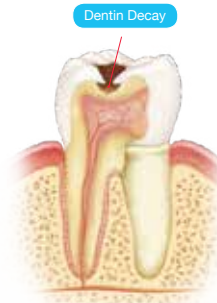
Restoring the tooth with a filling is often necessary