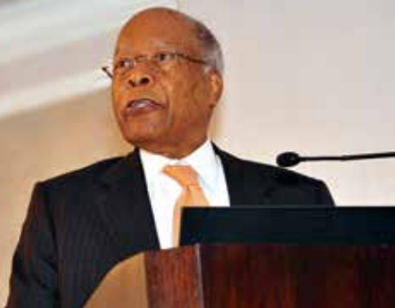
The Honorable Louis W. Sullivan, MD