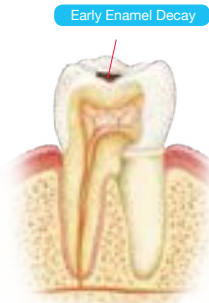
Left untreated, the area may continue to break down, resulting in early enamel decay