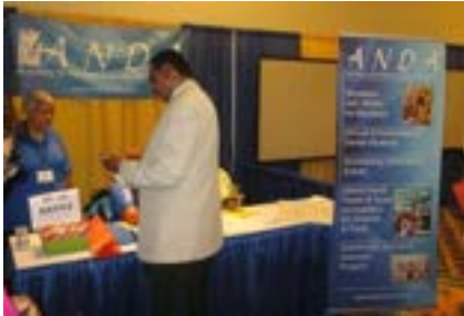
ANDA in the Exhibition Hall