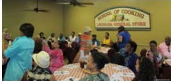
New Orleans School of Cooking