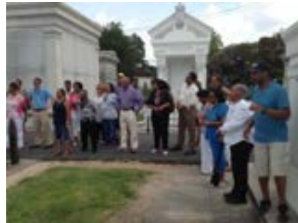
"New Orleans Highlights" City Tour