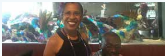
Members of the Greater Columbus Dental Hygienists' Society

The 2017-2019 NDHA Board of Trustees wishes to give special "THANKS" to all of the sponsors, supporters, members and friends who through their unwavering support, never ending hard work and abundance of ideas, helped to make the 2018 NDHA convention one of the absolute best, ever. Also, "THANK YOU" to the National Dental Association and all the affiliates for your assistance and support.