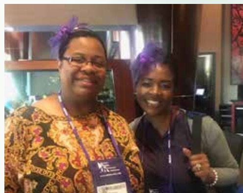
Members of the Greater Columbus Dental Hygienists' Society