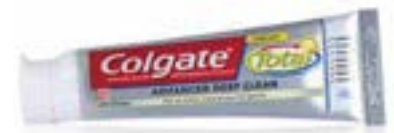
COLGATE TOTAL® ADVANCED DEEP CLEAN

Try these Colgate® toothpastes to help keep your mouth healthy.