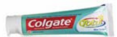
COLGATE TOTAL® FRESH MINT STRIPE