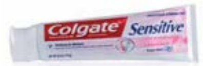
COLGATE® SENSITIVE WHITENING