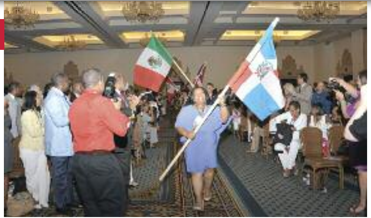
The Parade of Flags by the Hispanic Dental Association representing all Spanish speaking countries at the Opening Session