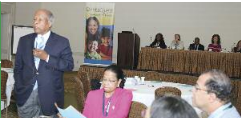
Dr. Louis Sullivan participates at the "Presidents' Symposium Part II – The Media and Multi-Cultural Messaging", sponsored by DentaQuest Foundation.